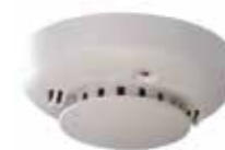
Smoke and Heat detectors