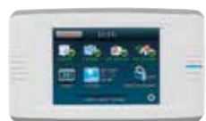
Two-Way Talking Touch Screen